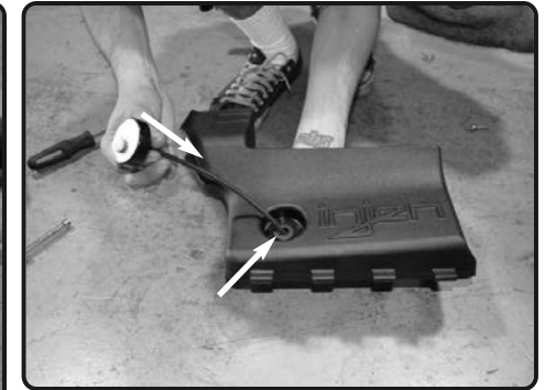
4. Place the grommet into the Injen upper air box. Next, connect the 3mm vacuum line to the Filter Minder. Then insert the vacuum line through the grommet.