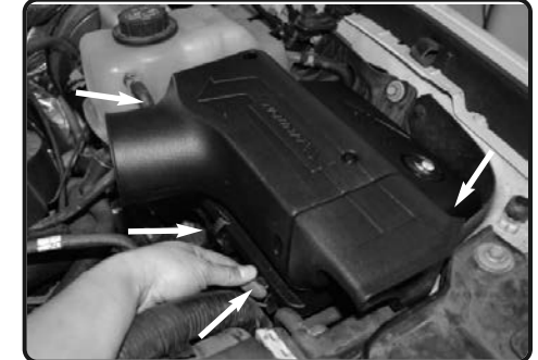
8. Install the Injen upper airbox and plenum onto the lower OEM airbox assembly and attach the 3 factory metal clips to secure the Injen air box to the OEM air box.