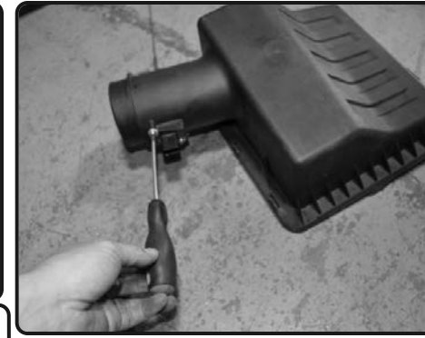
3. Use a torx screw driver to remove the screws to remove the MAF sensor from the stock OE air box assembly.