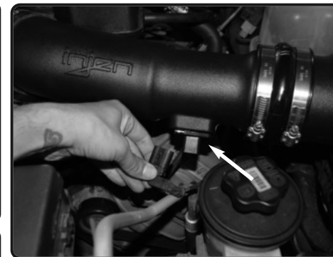
11. Install the MAF sensor and 2-M4 bolts to secure the MAF sensor to the Injen intake tube. Re-connect the MAF harness.