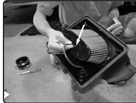
7. Connect the 3mm vacuum line from the filter minder in figure 6 to the fitting on top of the filter.