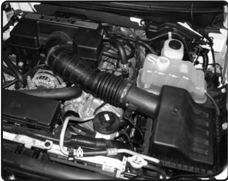
1. Stock intake system shown.