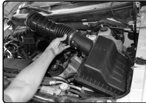
2. Disconnect the MAF sensor harness and unclip the 3 metal tabs holding the upper air box to the lower air box. Loosen the clamp on the air duct and then remove the upper box assembly and air filter panel.