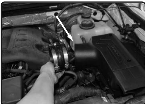
9. Place the 4.00" hump hose and 2-#64 clamps onto the Injen intake plenum. Make sure you push the hump hose all the way over to allow room for the intake tube.