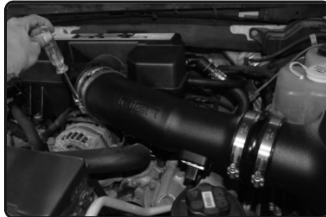
10. Install a 4.00" straight hose and 2-#64 clamps onto the OE air box resonator and then install the Injen intake tube. Adjust the intake pipe for best fitment and then secure all the clamps.