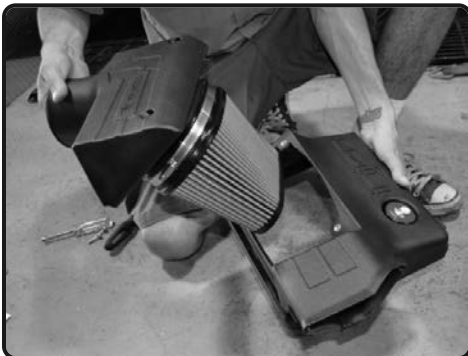
5. Once the Filter Minder is installed in the upper air box, install the filter onto the Injen air box plenum.