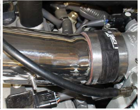
The intake is inserted into the throttle body hose and the intake bracket is lined up to the vibra-mount stud.