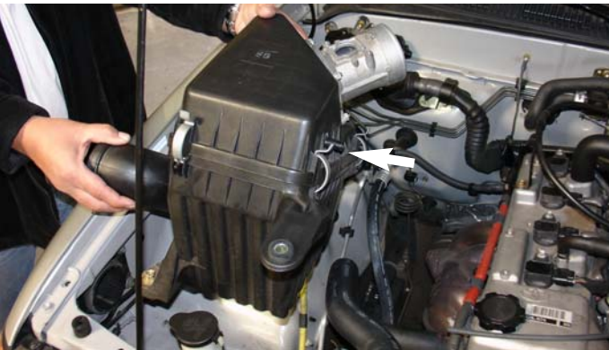
Remove the m6 bolts holding the air intake box to the fender well and the vacuum hose connected to the air box. Pull the air intake box out of the engine compartment.