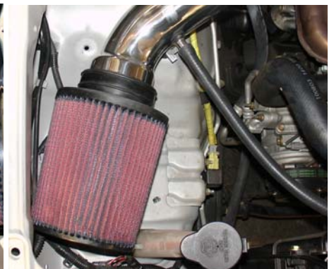
Once the filter has been placed over the intake end and the intake is set up against the filter stop continue to tighten the filter clamp.