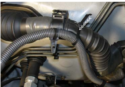
Use the zip tie to secure the sensor harness to the ECU main harness as shown above.