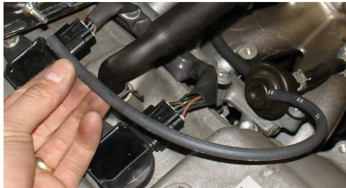
The stock 4mm pressure fuel regulator line is now pressed onto the 3/16" intake port.