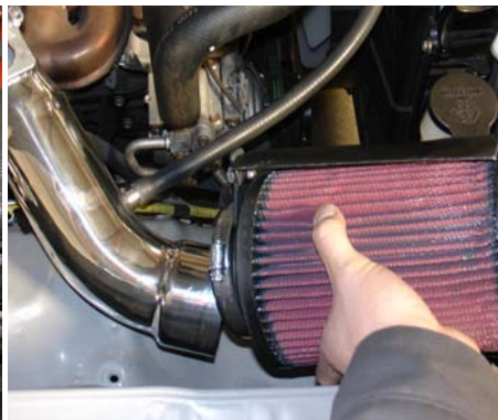
The 3 1/2" inverted top filter is set in the engine compartment ready to be installed.