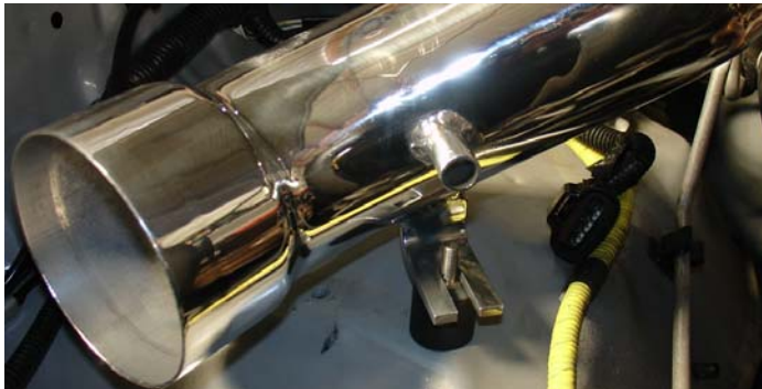
The intake bracket is sitting flush over the vibra-mount stud and lined up to the throttle body.