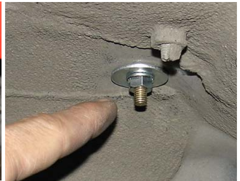
The flange nut and fender washer is fastened to the vibra-mount stud.