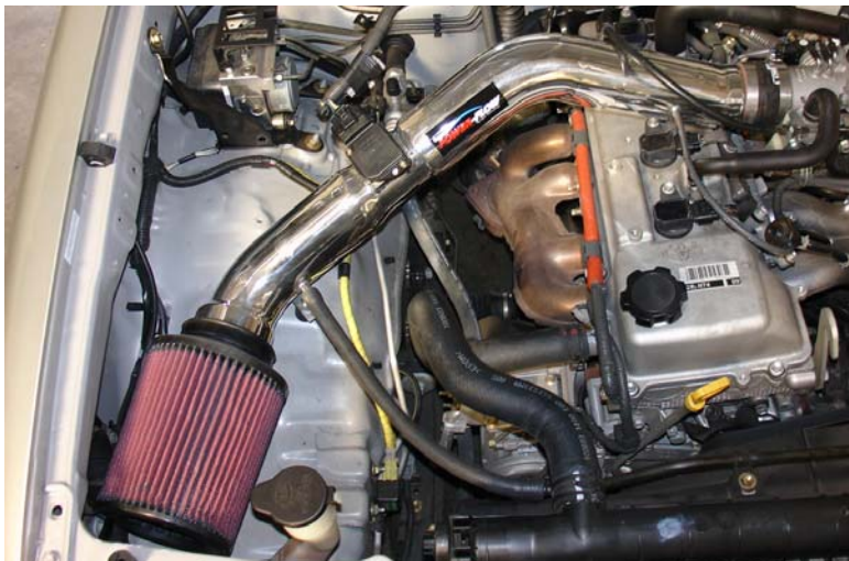
The new Hydro-shield By Injen