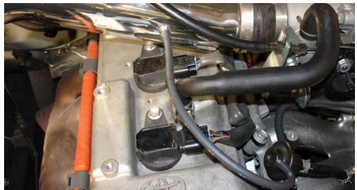
A good shot of the 4mm line connected to the pressure fuel regulator and the 3/16" intake port.