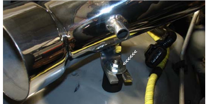
The flange nut and fender washer is screwed onto the vibra-mount stud. Do not over-tighten the flange nut at this point until the filter has been placed on the end.