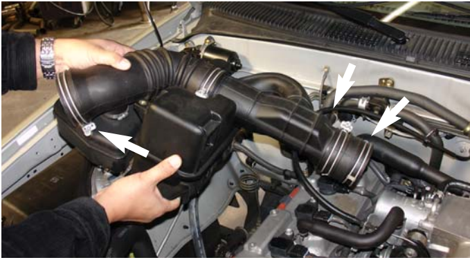
Loosen the clamps on the air intake box and the throttle body, remove the vacuum hose attached to the intake inlet and then continue to remove the air intake duct as shown above.