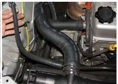
The 14"-10mm vacuum hose is now connected to the charcoal canister hard pipe.