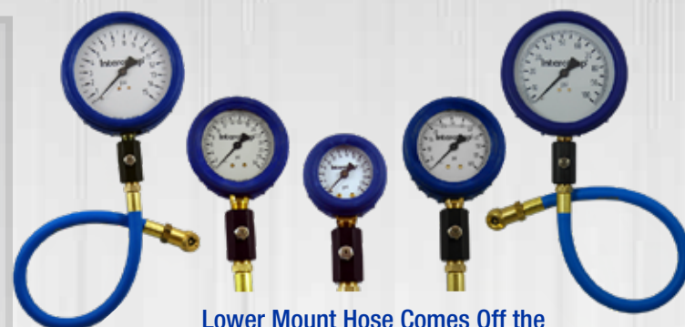
Lower Mount Hose Comes Off the Bottom Making it Easier to Hold & Read