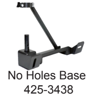
No Holes Base 425-3438