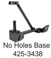
No Holes Base 425-3438