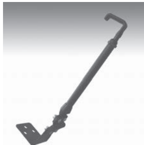
SCREEN SUPPORT - ACD

The Brace Kit attaches to the stand providing additional support. It can be adjusted in length and mounts to flat, vertical or angled surfaces.