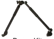
Brace Kit 425-5272