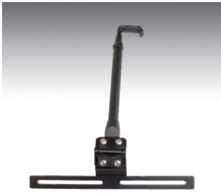
SCREEN SUPPORT - A-MOD

Computer securing system uses Kensington locking system. Fasten security cable to permanent structure in vehicle.