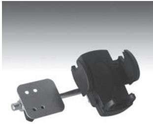
PIVOTING CELL PHONE HOLDER

Specifications subject to change without notice