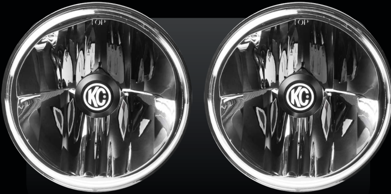
Gravity LED Headlights Pair Pack System #42351