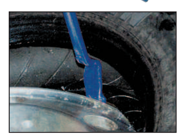
• Bent end For mounting and demounting bottom bead