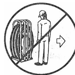
DO NOT STAND IN TRAJECTORY ZONE