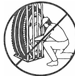
DO NOT REACH INTO CAGE DURING INFLATION

Danger: Cage may move in the event of rim separation or other tire failure.