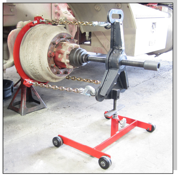
K-1356 Brake Drum Puller shown with K-1350 Wheel Grabber

The K-1356 Brake Drum Puller gives you the option of re-using both