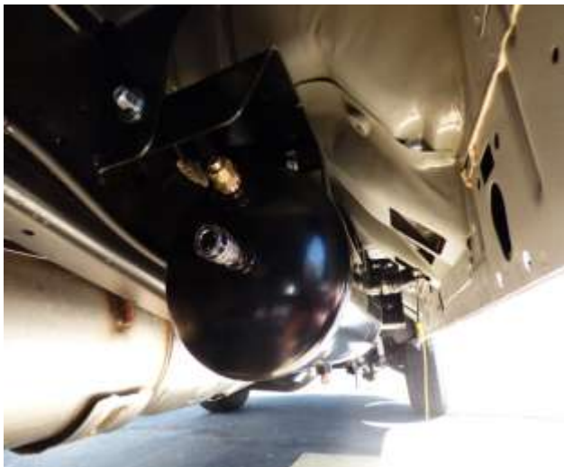
Location of Air System Installed (Passenger Side)

Thank you for purchasing a Kleinn Air Horns Super Duty Train Horn System. Kleinn Train Horn Systems are the only 100% bolt-on train horn and onboard air systems for 2011-2015 Ford F-250/F-350 trucks on the market today.