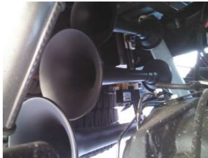
Location of Air Horn Installed (In front of spare tire)