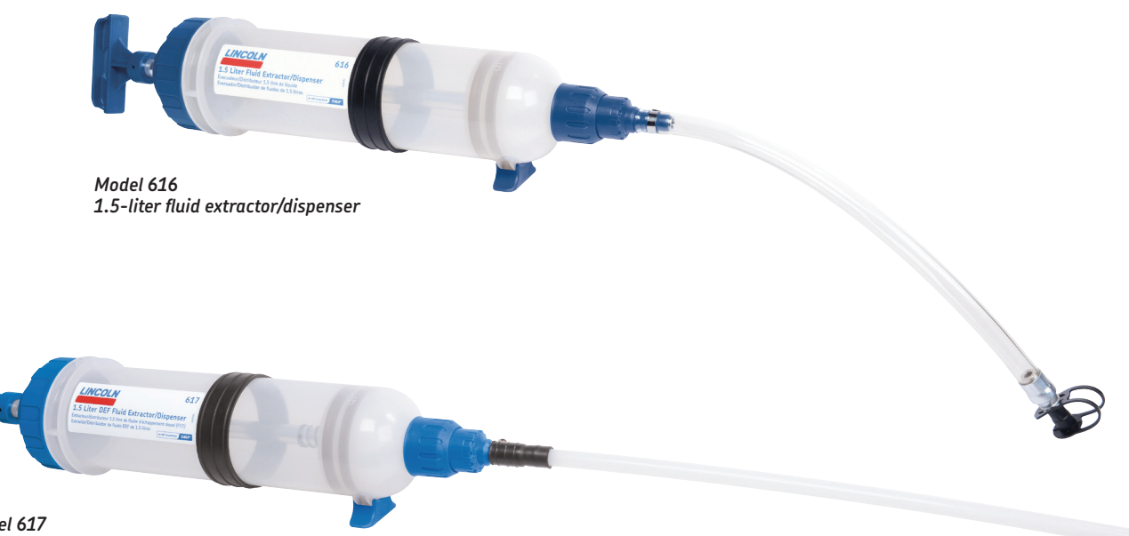
Model 617 1.5-liter DEF fluid extractor/dispenser

Lincoln's model 616 and 617 (DEF) fluid extractors/dispensers were developed to complement our line of proven fluid transfer equipment. These simple-to-use, syringeaction tools feature a large, 1.5-liter fluid reservoir, twist-valve and dual-seal piston designed to transfer fluids quickly with no mess.