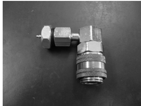
Coupler with Filter

Neutronics to insert photo of unit upon receiving Mastercool labels.