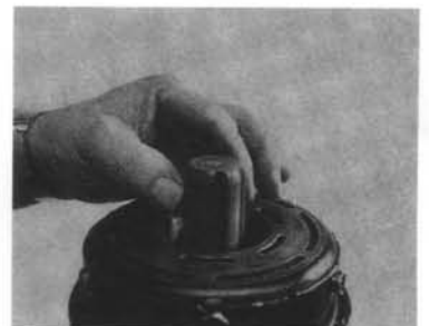
O-RING / RETAINING RING INSTALLER