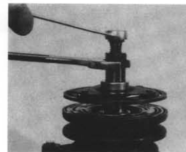
CLUTCH END PLATE INSTALLER