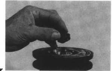
O-RING INSTALLATION GUIDE