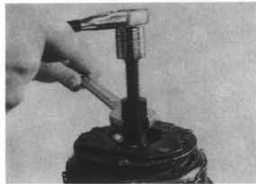
CLUTCH END PLATE REMOVER