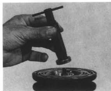
SEAL SEAT REMOVER / INSTALLER