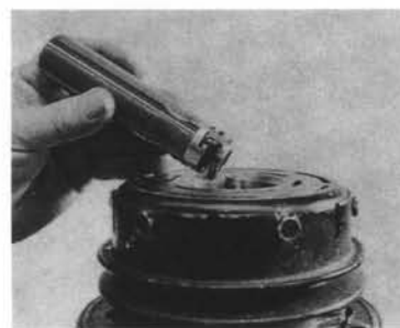
SEAL REMOVER / INSTALLER