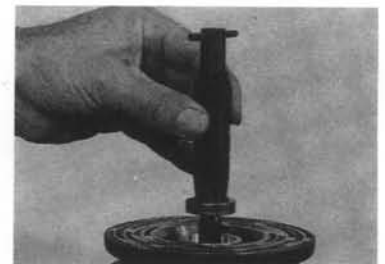
SEAL SEAT REMOVER / INSTALLER