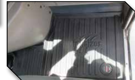
Figure 10 - Passenger Mat in Position

17. Use the same process listed in steps 7-14 above to attach the passenger mat retention hook to the floor. Follow the same basic steps to prime the surface and attach the hook to the floor of the cab as shown in Figure 11.