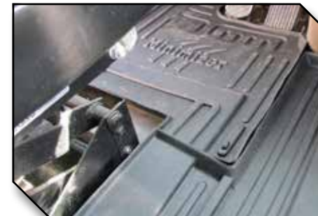
Figure 9 - Driver Mat Hook in Position

Mark the approximate position where the hook needs to be attached to the floor. Once the position is located, remove the driver mat from the truck.