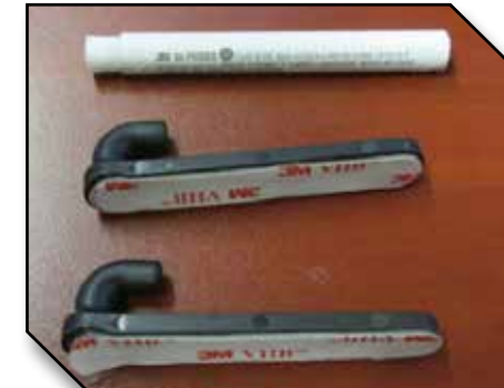
Figure 6 - Driver Side Electrical Enclosure & Floor Mat

7. Install the center mat in the truck and verify fit. In some cases the center mat will need to be trimmed on the left side to allow for a driver seat with a large base plate. Specifically, trimming is required when using with the "Minimizer Long Hall Series seat". There is a raised rib molded into the center mat that is designed to be used as trim guide. The area shaded in blue on Figure 7 below is the area to be trimmed.