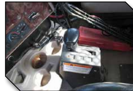
Figure 8 - Floor Mounted Control Tower

8. Insert a hook up through the hole in the right rear corner of the driver side floor mat. The hook should fit flush with the underside of the floor mat.