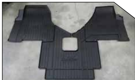
Figure 1 - Kit 103738 Contents

• Contents of floor mat kit # 103739 are shown below in Figure 2.