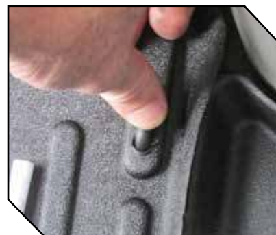
Figure 7 - Apply Pressure to the Hook

17. For optimal adhesion do not disturb the hook for a period of 20 minutes after installation. Figure 8 below shows the properly installed driver mat and hook.