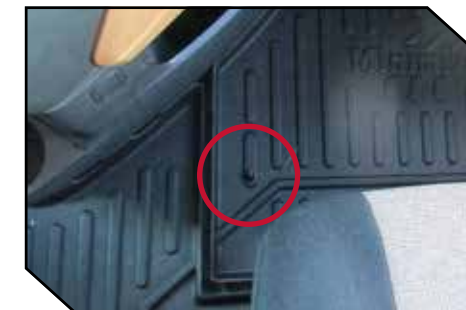
Figure 10 - Passenger Mat Retention Hook Location

23. Prior to operating the vehicle, read the Safety Instructions for Vehicle Operation.