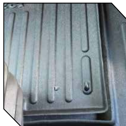
Figure 8 - Driver Mat Hook Installation

18. Pull the driver mat toward the rear of the truck to confirm that the hook is fully engaged into the mat and that the hook is adhered to the floor. If the hook is not functioning properly or the mat cannot be securely installed, do not use a Minimizer floor mat on the driver side of the vehicle.