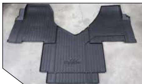
Figure 2 - Kit 103739 Contents

• Contents of floor mat kit # 103739 are shown below in Figure 2.