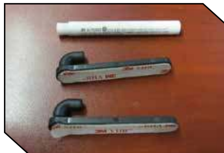
Figure 6 - Retention Hook and Primer 94

8. Insert one hook through the hole at the right edge of the driver mat. The hook should fit flush with the underside of the driver mat.