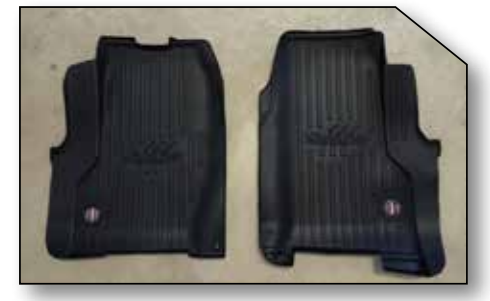
Contents of floor mat kit # FKFRTL2B are shown below in Figure 3. Figure 3 - Kit FKFRTL2B Contents

Contents of floor mat kit # FKFRTL1B are shown below in Figure 2. Figure 2 - Kit FKFRTL1B Contents