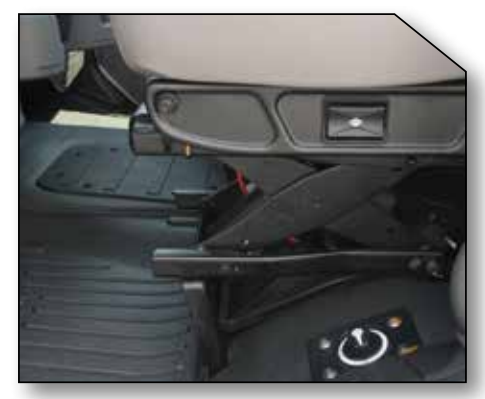
Figure 1 - National Driver Seat with Suspension Base

Contents of floor mat kit # FKFRTL1B are shown below in Figure 2. Figure 2 - Kit FKFRTL1B Contents