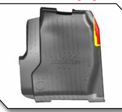
Figure 5 - Driver Mat Trimming Diagram

6. Inside the package with the installation instructions, locate a black plastic retention hook as well as a white tube of Primer 94 as shown in Figure 6.