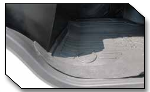
Figure 11 - Passenger Mat with Bench Seat

20. Move the accelerator, brake, and clutch pedals through their full range of motion to confirm there is no interference with the Minimizer floor mat.