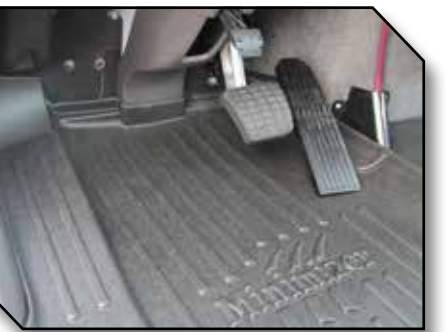
Figure 4 - Driver Mat in Position

a) For Freightliner models M2 112, 108SD and 114SD a small portion of the right side of the driver mat must be trimmed away in order to fit safely around the dog house trim panel. There is a raised rib molded into the driver mat to contain liquid and act as a trim guide. See the red shaded area in Figure 5 to identify the portion to trim.