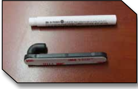
Figure 6 - Hook and Primer 94

7. Insert the hook up through the hole at the right rear corner of the driver side floor mat. The hook should fit flush with the underside of the floor mat.