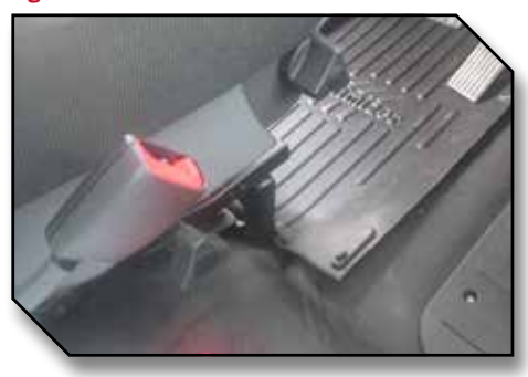
Figure 7 - Retention Hook Position

9. Unpack the tube of Primer 94 and read the safety precautions printed on the tube.