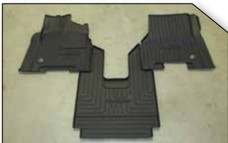
Figure 1 - Kit FKFRTL3MB Contents