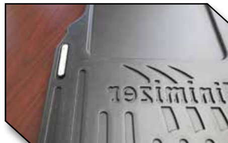
Figure 9 - Hook Inserted in Driver Mat

10. Once the hook is in place, let the driver mat and hook rest on the truck floor.