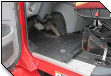
Figure 6 - Driver Mat Fit with OEM Seat Base

Note: When installing in trucks equipped with an EzyRider driver seat the floor mat material behind the raised rib will need to be trimmed away with a utility knife as shown in Figure