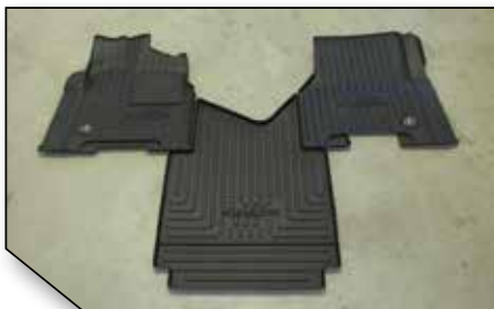
Figure 2 - Kit FKFRTL3AB Contents