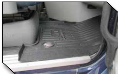
Figure 5 - Passenger Mat Trimmed and Installed with EzyRider Seat

7. Test fit the driver mat in the truck. The driver mat is designed to fit underneath the throttle pedal. To install the driver mat, lift up the heel portion of the throttle pedal and slide the front of the floor mat underneath the pedal. Confirm that the mat is pushed all the way forward so it rests against the fire wall. Figure 6 below shows the driver mat installed in a truck with an OEM seat.