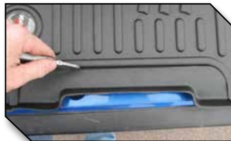
Figure 7 – Driver Mat Trim for Installation With Ezy Rider Seat or Aftermarket Seat.

8. Inside the package with the installation instructions, locate a black plastic retention hook as well as a white tube of Primer 94 as shown in Figure 8.