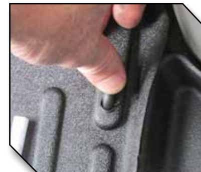
Figure 10 - Apply Pressure to the Hook

18. For optimal adhesion do not disturb the retention hook for a period of 20 minutes after installation. Figure 11 below shows the properly installed driver mat and hook.