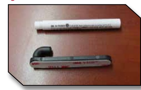
Figure 8 - Hook and Primer 94

9. Insert the hook up through the hole at the right rear corner of the driver mat as shown in Figure 9. The hook should fit flush with the underside of the driver mat.