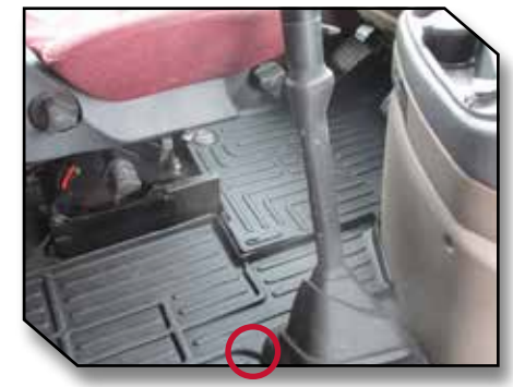
Figure 10 – Confirm Location Driver Mat and Hook

10. Once the hook is in place, let the driver mat and hook rest on the floor as shown in Figure 10.