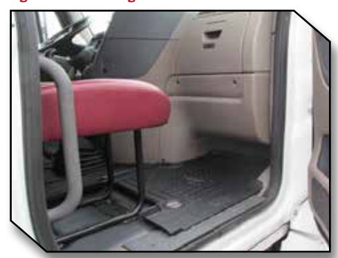
Figure 13 - Passenger Mat With Fixed Seat

20. Pull the driver mat toward the front of the truck to confirm that the hook is fully engaged into the mat and that the hook is adhered to the floor. If the hook is not functioning properly or the mat cannot be securely installed, do not use a Minimizer floor mat on the driver side of the vehicle.