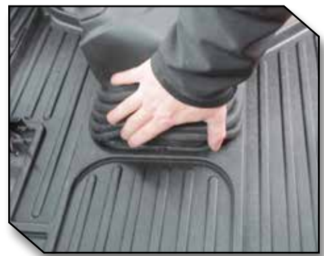
Figure 6 - Straightening Rubber Boot

7. Position the driver mat in the truck as shown in Figure 7.