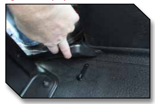
Figure 12 – Properly Installed Hook

18. For optimal adhesion do not disturb the hook for a period of 20 minutes after installation. Figure 12 below shows the proper installation of the hook.