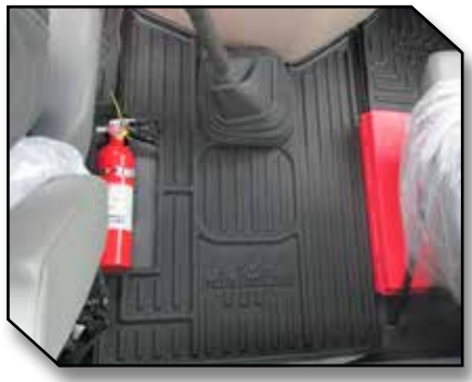
Figure 5 – Trimmed Center Mat Installed

6. Straighten the rubber boot that surrounds the gear shift so it rests smoothly on top of the center mat as shown below in Figure 6.