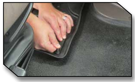
Figure 11 - Apply Pressure to Hook

18. For optimal adhesion do not disturb the hook for a period of 20 minutes after installation. Figure 12 below shows the proper installation of the hook.