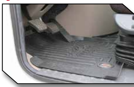
Figure 7 - Driver Mat in Position

8. Inside the package with the installation instructions, locate a black plastic retention hook as well as a white tube of Primer 94 as shown in Figure 8.