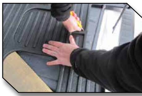
Figure 4 – Trimming With Utility Knife

Note: Figure 5 below shows the center mat from kit FKFRTLCASCMB installed in a day cab truck. This mat was trimmed to fit around the existing fire extinguisher and DOT roadside safety kit.