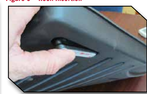
Figure 9 - Hook Insertion

10. Once the hook is in place, let the driver mat and hook rest on the floor as shown in Figure 10.