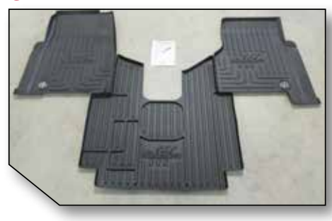
Figure 2- Kit FKFRTLCASCMB Contents

• Contents of floor mat kit # FKFRTLCASCMB are shown below in Figure 2.