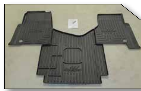
Figure 1 – Kit FKFRTLCASCAB Contents

• Contents of floor mat kit # FKFRTLCASCMB are shown below in Figure 2.