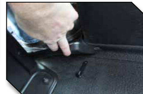
Figure 12 – Properly Installed Hook

18. For optimal adhesion do not disturb the hook for a period of 20 minutes after installation. Figure 12 below shows the proper installation of the hook.