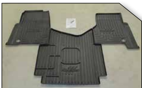
Figure 1 – Kit FKFRTLASCAB Contents