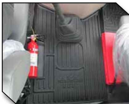
Figure 5 – Trimmed Center Mat Installed

6. Straighten the rubber boot that surrounds the gear shift so it rests smoothly on top of the center mat as shown below in Figure 6.