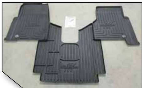
Figure 2 - Kit FKFRTLASCMB Contents