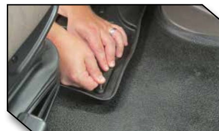
Figure 11 - Apply Pressure to Hook

18. For optimal adhesion do not disturb the hook for a period of 20 minutes after installation. Figure 12 below shows the proper installation of the hook.