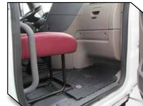
Figure 13 - Passenger Mat With Fixed Seat

20. Pull the driver mat toward the front of the truck to confirm that the hook is fully engaged into the mat and that the hook is adhered to the floor. If the hook is not functioning properly or the mat cannot be securely installed, do not use a Minimizer floor mat on the driver side of the vehicle.