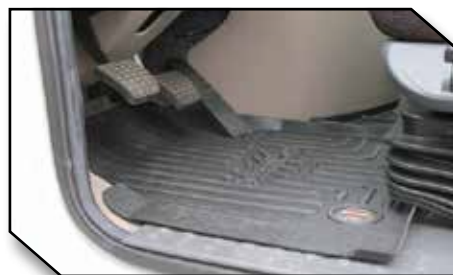
Figure 7 - Driver Mat in Position

8. Inside the package with the installation instructions, locate a black plastic retention hook as well as a white tube of Primer 94 as shown in Figure 8.