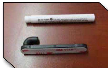
Figure 8 - Hook and Primer 94

9. Insert the hook up through the hole at the right rear corner of the driver mat as shown in Figure 9. The hook should fit flush with the underside of the driver mat.