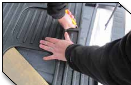
Figure 4 – Trimming With Utility Knife

Note: Figure 5 below shows the center mat from kit FKFRTLASCMB installed in a day cab truck. This mat was trimmed to fit around the existing fire extinguisher and DOT roadside safety kit.