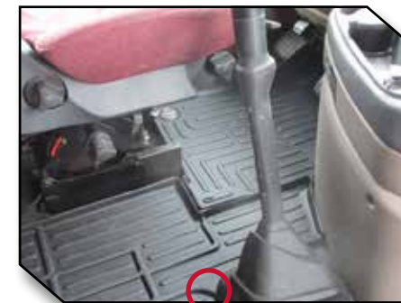
Figure 10 – Confirm Location Driver Mat and Hook

11. Mark the approximate position where the hook will need to be attached to the floor with a finger. Once the position is located, remove the driver mat from the truck.