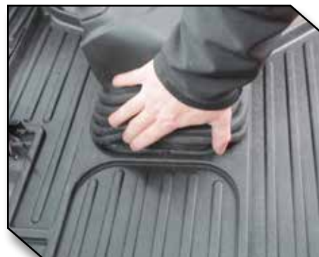
Figure 6 - Straightening Rubber Boot

7. Position the driver mat in the truck as shown in Figure 7.