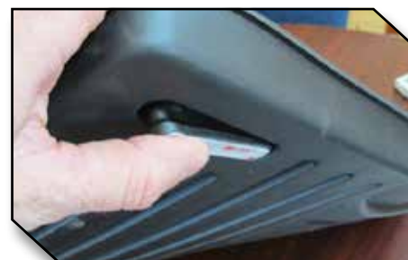
Figure 9 - Hook Insertion

10. Once the hook is in place, let the driver mat and hook rest on the floor as shown in Figure 10.