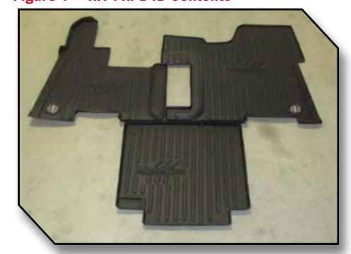
Figure 1 - KIT FKPB4B Contents

• Kit FKPB4B shown in Figure 1 is compatible with Peterbilt 378, 379, 385, 357 trucks model years 2006-2007.