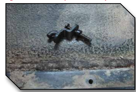
Figure 7 - Hook and Spacer Assembly

c) Insert the hook assembly through the transmission cover and tighten using a #3 Phillips screwdriver. Orient the floor mat hook so it points straight toward the gearshift as shown in Figure 8.