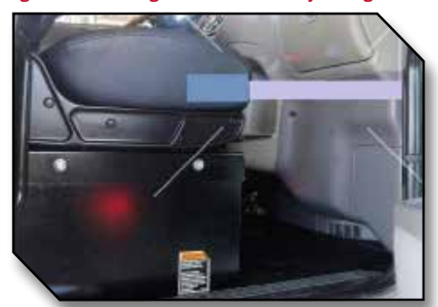
Figure 2 - Passenger Seat with Battery Storage