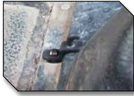
Figure 8 - Proper Hook Orientation

c) Insert the hook assembly through the transmission cover and tighten using a #3 Phillips screwdriver. Orient the floor mat hook so it points straight toward the gearshift as shown in Figure 8.