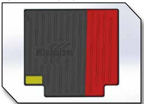
Figure 4 - Trimming Diagram

7. Next install the mat for the passenger side of the vehicle as shown in Figure 5.