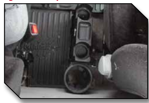
Figure 3 - Factory Thermos

6. For cases where a fire extinguisher is mounted behind the driver seat, the left rear corner of the center mat shaded in yellow may be trimmed to allow for clearance.