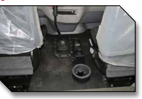
Figure 4 - Thermos Holder

• For day cab trucks that have a fire extinguisher mounted in between the driver seat and passenger seat trim away the red shaded portion of the center mat preserving the tall rib for liquid containment.