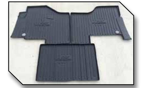
Figure 2 - KIT FKPCR1AB Contents

• The passenger side floor mat is not compatible with trucks equipped with a passenger seat base battery storage unit as shown in Figure 3.