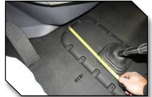
Figure 6 - Hook and Spacer Assembly

b) Locate the retention hook provided in the floor mat kit. Insert the screw through the hole in retention hook and replace the screw in transmission cover. Tighten the screw using a #3 Phillips screwdriver. Orient the hook so the tip points toward the passenger side. Figure 7 below shows the proper hook orientation.