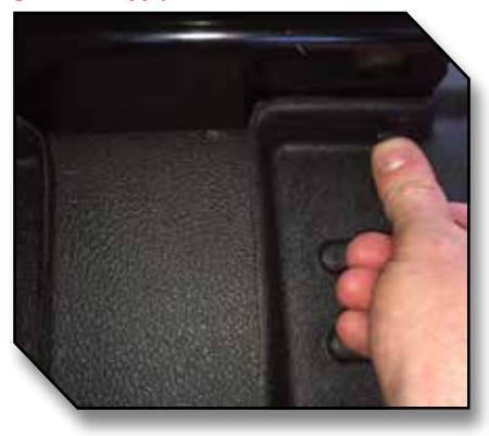
Figure 10 - Apply Pressure to Hook

k) Once the hook is in position apply firm pressure to the hook as shown in Figure 10 for 30 seconds to ensure a proper bond to the metal seat base.