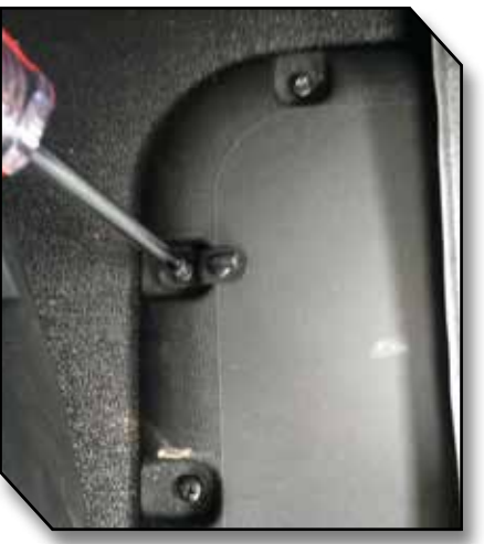
Figure 7 - Retention Hook Installation

d) Finish installing the driver side floor mat and engage it into the retention hook. The driver mat must be pushed all the way forward so the front lip is makes full contact with the lower dashboard kick panels as shown in Figure 8. Figure 8 - Kit FKPCR1MB Driver Mat with Retention Hook