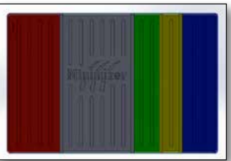
Figure 5 - Center Mat Trimming Diagram

6. Install the passenger floor mat for the passenger side of the vehicle.