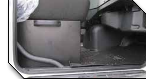
Figure 13 - Fixed Passenger Seat (Hand Trimming Required)

16. Once the passenger mat is in position, install the passenger mat hook. For trucks with rubber floors use the same process listed in steps 7-15 above. For trucks with carpeted floors install the hook at the right front corner of the passenger side area as shown in Figure 14. There is a small oval shaped trim line visible on the outside perimeter of the mat where the hook opening should be trimmed. Follow the same basic steps to prime the steel surface and attach the hook to the cab.