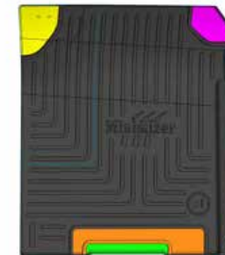
Figure 12 - Driver Mat Trimming Diagram

• The passenger floor mat is designed to accommodate both fixed seats and suspension seats. Trucks that are equipped with a fixed base