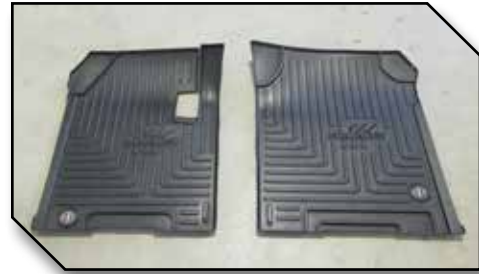
Figure 1 - FKSTAR1B Contents

• Kit FKWS2B is compatible with 2012-2016 Western Star 4900SA, 4900FA, 4900SF, 4900SB.