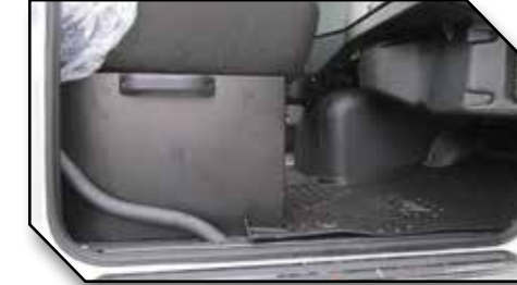
Figure 13 - Fixed Passenger Seat (Hand Trimming Required)

16. Once the passenger mat is in position, install the passenger mat hook. For trucks with rubber floors use the same process listed in steps 7-15 above. For trucks with carpeted floors install the hook at the right front corner of the passenger side area as shown in Figure 14. There is a small oval shaped trim line visible on the outside perimeter of the mat where the hook opening should be trimmed. Follow the same basic steps to prime the steel surface and attach the hook to the cab.