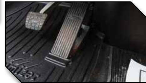
Figure 5 - FKSTAR3B Driver Mat Installation

• In some cases a steel or plastic electrical enclosure will be mounted on the floor area in the left front corner of the cab as shown in Figure 6. If the electrical enclosure is present, the left front portion of the driver mat will need to be hand trimmed along the raised rib. The area to trim is shaded red in Figure 7.