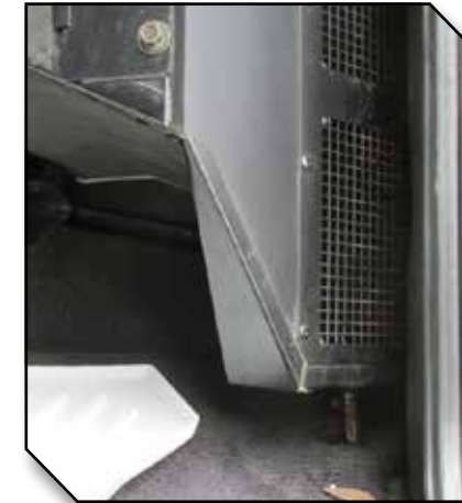
Figure 11 - High Capacity HVAC Unit

• For Western Star models 4900SA, 4900FA, 4900SB, 4900SF years 1998 - 2011 the yellow shaded area shown in Figure 12 will likely need to be hand trimmed along the raised rib at the time of installation. Test fit the mat before trimming to confirm.