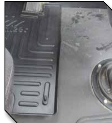
Figure 9 - Driver Mat Hook Installation

9. Unpack the tube of Primer 94 and read the safety precautions printed on the tube.