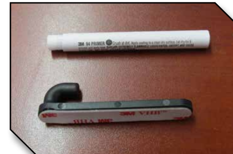
Figure 8 - Hook and Primer 94

7. Insert hook up through the hole in the right rear corner of the driver side floor mat. The hook should fit flush with the underside of the floor mat.