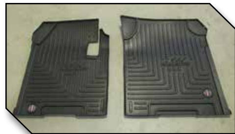
Figure 3 - FKSTAR3B Contents

* FKSTAR3B passenger mat requires hand trimming. Refer to installation step 15 for details.