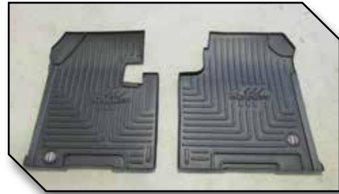
Figure 2 - FKSTAR2B Contents

• Kit FKWS3B is compatible with Western Star 4900SA, 4900FA 1998-2011