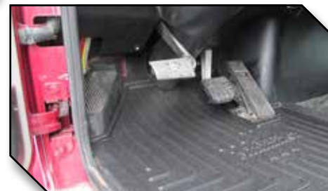
Figure 6 - Driver Side Electrical Enclosure & Floor Mat

• The driver mat is designed to fit the most common OEM seats. Trucks that are equipped with non-standard aftermarket seats may require hand trimming at the time of installation. If needed there is a raised rib molded into the driver mat to use as a trim guide. The area shaded blue shown in Figure 7 is the portion to be removed. Use a sharp utility knife to remove this portion.