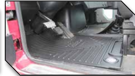
Figure 4 - Driver Mat Position

• The driver mat must be pushed all the way forward so the front lip is making full contact with the doghouse trim panel and fire wall.