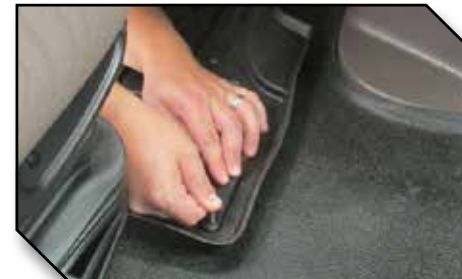
Figure 10 - Apply Pressure to Hook

15. Position the passenger mat in the truck. Make sure the passenger mat is pushed all the way forward so the outside lip makes full contact with the doghouse trim panel and fire wall.