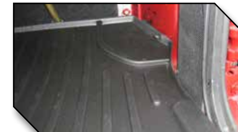
Figure 14 - Fixed Base Passenger Seat with Trimmed Mat

17. Confirm that the retention hook is fully engaged into the driver mat and that the hook is adhered to the floor. If the driver mat hook is not functioning properly or the mat cannot be securely installed, do not use a Minimizer floor mat on the driver side of the vehicle.