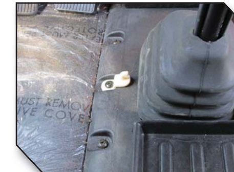
Figure 14 - Proper Hook Orientation

10. Install the driver side floor mat and engage it into the retention hook. The driver mat must be pushed all the way forward so the front lip makes full contact with the lower dashboard kick panels. If installing kit FKP2B nest the right edge of the mat over the top of the left hand edge of the passenger mat to lock the floor mats together. If installing kit FKP3B nest the left edge of the passenger mat over the top of the driver mat.