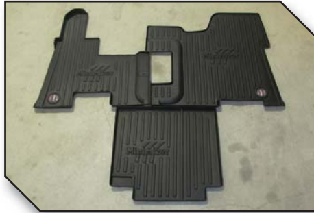
Figure 1 - KIT FKP2B Contents

• Kit FKP3B shown in Figure 2 is designed for Peterbilt 365,367,384,386,388, 389 model trucks with the driver seat base positioned 28.75" behind the lower kick panel of the dashboard. See Figure 3 for seat measurement instructions.