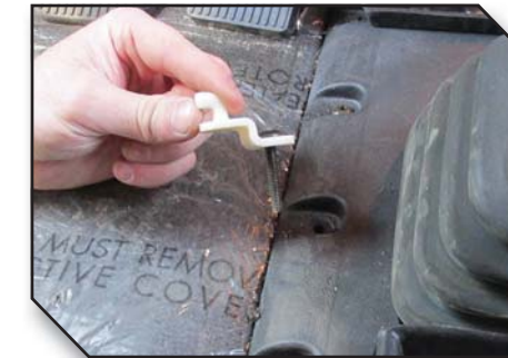
Figure 13 - Hook Installation

c) Insert the hook through the hole in the transmission cover and tighten using a #3 Phillips screwdriver. Orient the hook so it points straight toward the gearshift as shown in Figure 14.