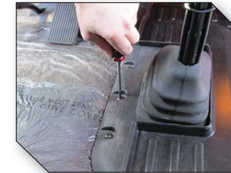
Figure 12 - Screw Removal

b) Insert the screw through the hole in the retention hook as shown in Figure 13.