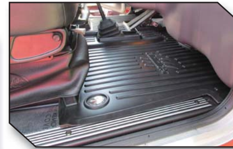
Figure 11 - Passenger Mat Fit

9. Install the retention hook to secure the driver side floor mat from any movement. Follow installation steps a, b, and c below.