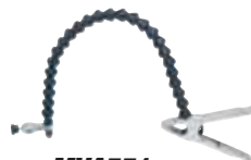
MVA551 Flexible Nozzle Support