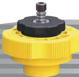
Model MVA661 GM Adapter