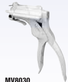
MV8030 Vacuum Pump w/o Gauge