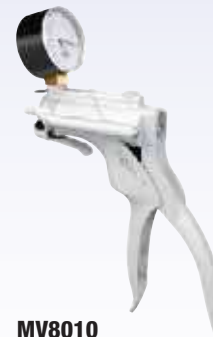
MV8010 Vacuum Pump w/ Gauge

In addition to these kits, Mityvac offers the following four models of Selectline pumps: