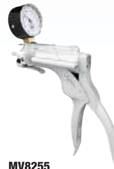
MV8255 Vacuum/Pressure Pump w/ Gauge