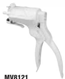
MV8121 Superpump Vacuum Pump w/o Gauge