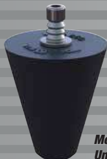
Model MVA660 Universal Adapter