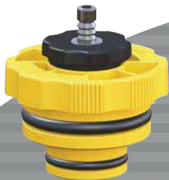
Model MVA662 Ford Adapter

Featuring a robust design and construction, all three adapters include an inline, barbed connection for a 1/4 in. internal diameter hose. A 90-degree barbed connector, MVA665 , is available separately and can be interchanged with the inline connector on MVA661 and MVA662 for applications with limited overhead.