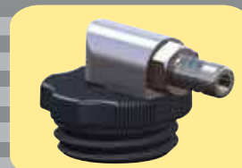
Model MVA665 90-degree Adapter