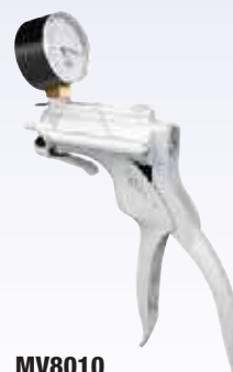
MV8010 Vacuum Pump w/ Gauge

In addition to these kits, Mityvac offers the following four models of Selectline pumps: