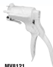
MV8121 Superpump Vacuum Pump w/o Gauge