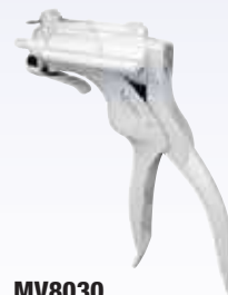
MV8030 Vacuum Pump w/o Gauge