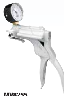
MV8255 Vacuum/Pressure Pump w/ Gauge