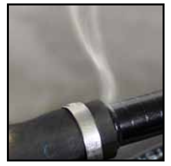
Smoke exposes the leak.

The cabinet design provides technician-friendly onboard storage of all adapters and accessories.