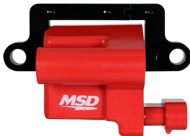
L-Series Truck, '99-'09, PN 8264/PN 82648