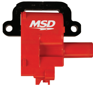
LS1/6, '98-'06, PN 8262/PN 82628

There are several versions of LS coils, it is important to verify the correct coil for your application.