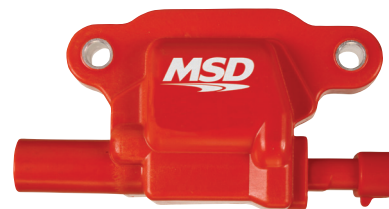
LS2/3/4/7/9, '05-'13, PN 8265/PN 82658