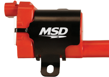
L-Series Truck '99-'07, PN 8263/PN 82638