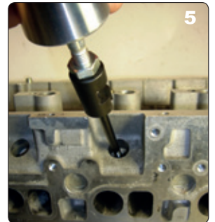
# 600 121 Small slide hammer

Remove broken glow plugs effectively and safely in 5 easy steps