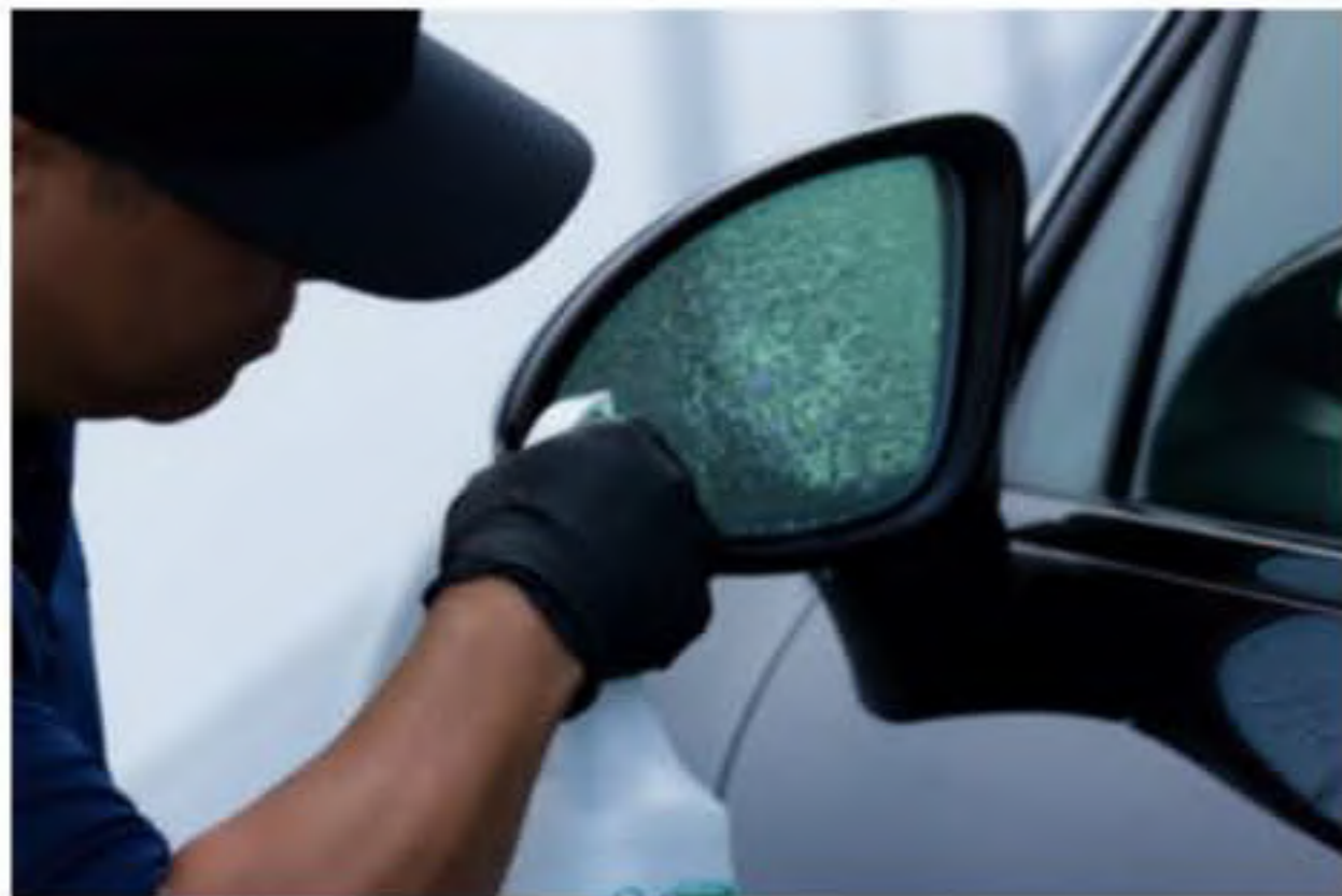
Step 1: Spray sufficient amount of lubricant on surface.