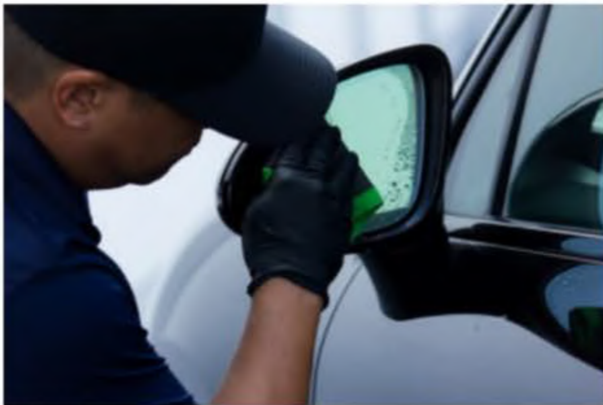
Step 2: Slide Autoscrub across the lubricated paint or glass surface using a back and forth motion with light to medium pressure. NOTE: Do not allow the lubricant to run dry on the surface.