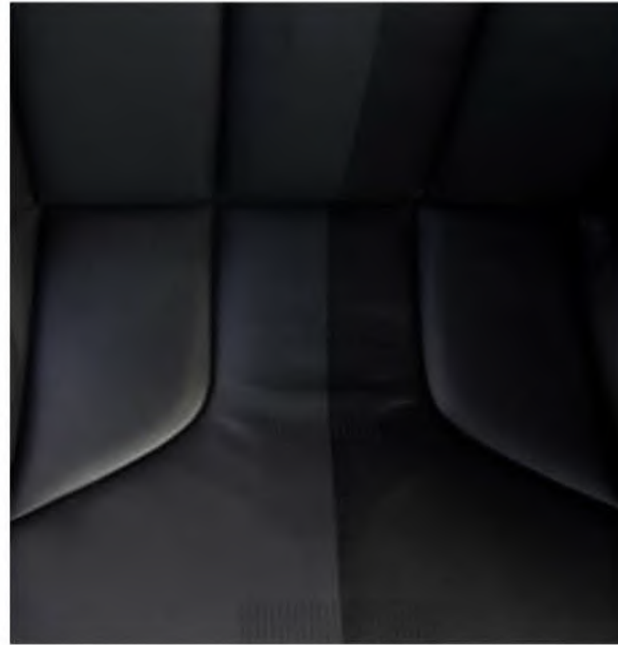
After <-----> Before