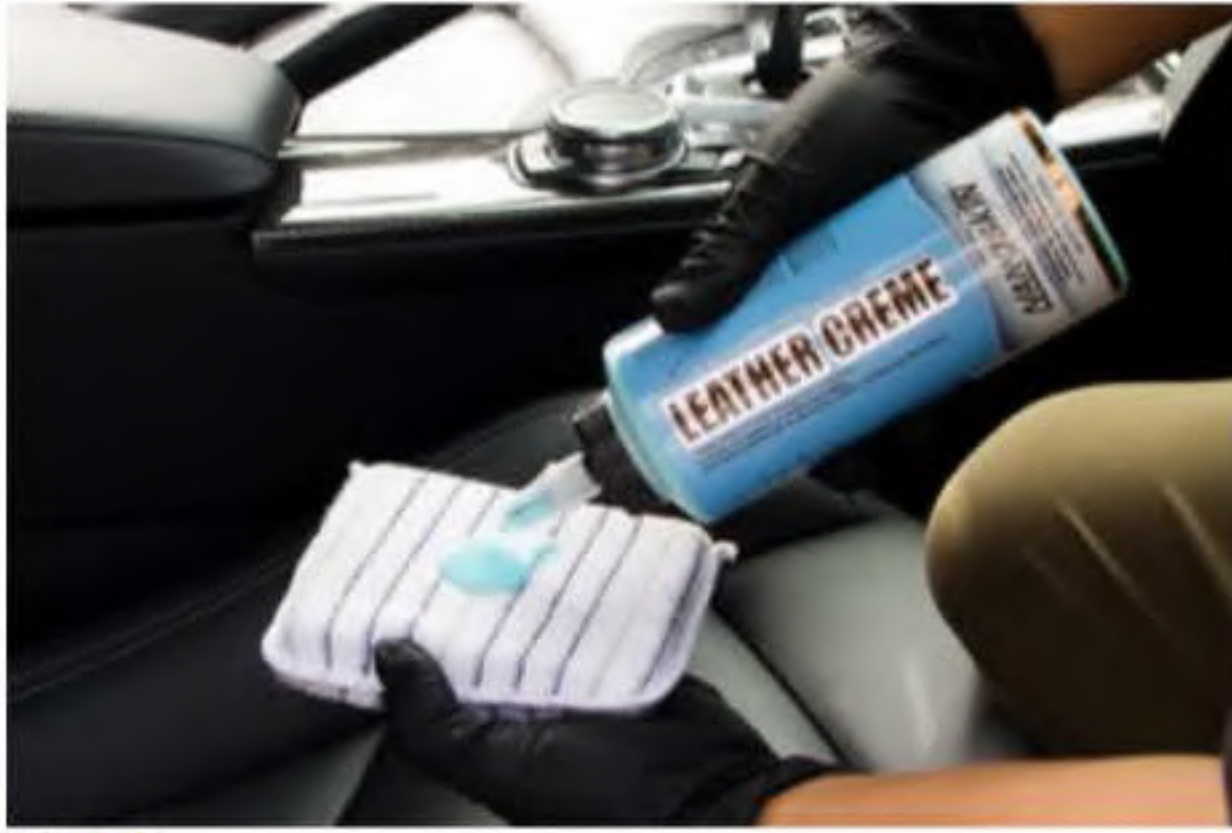
Step 1: Apply Leather Creme to a soft applicator pad