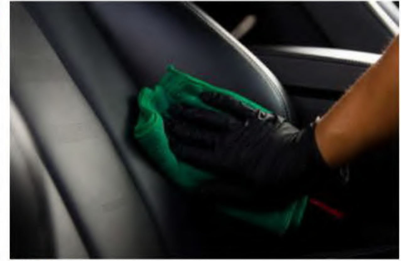
Step 3: Wipe and buff vinyl or leather of excess Leather Creme with a soft micro fiber towel