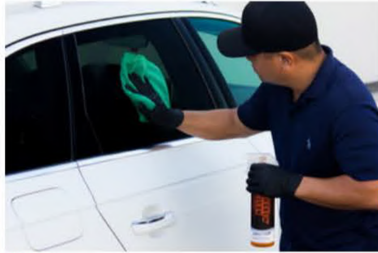
Step 2: Spread Shake N Clean around glass surface and flip towel to wipe clean and dry