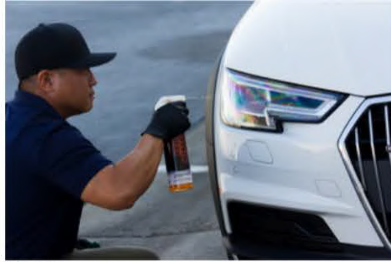
Step 1: Spray a sufficient but small amount Shake N Clean onto plastic surface.