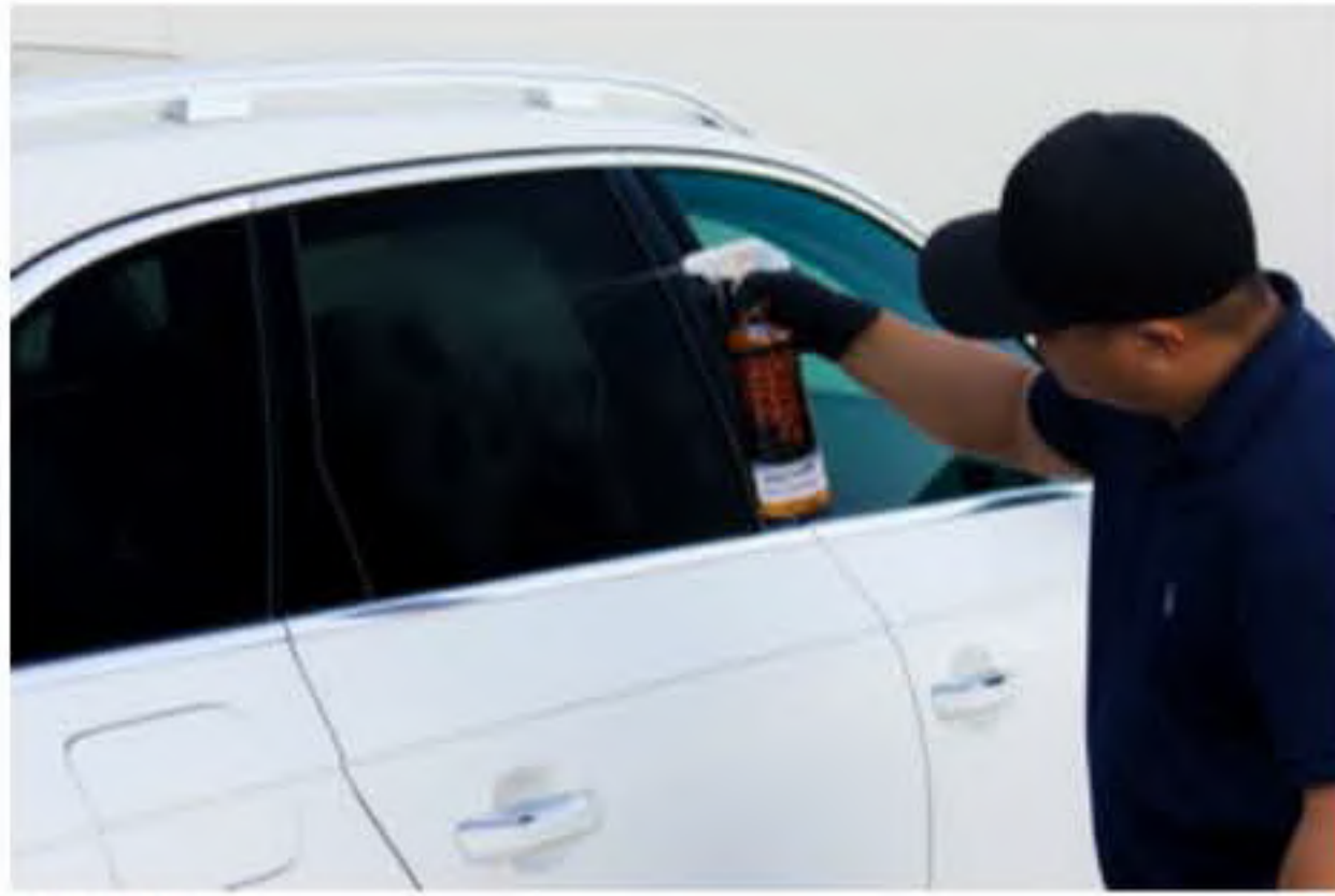
Step 1: Spray a sufficient but small amount Shake N Clean onto glass surface.