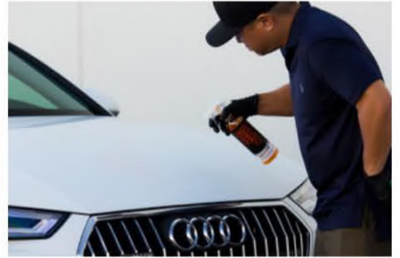
Step 1: Spray a sufficient amount of Shake N Clean on painted surface