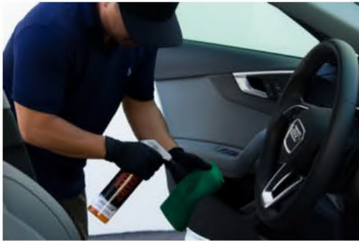
Step 1: Spray a sufficient but small amount Shake N Clean onto micro fiber towel