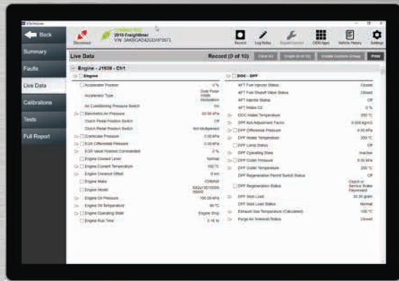
OEM FAULT CODES