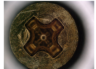
Figure 4: Brass terminal connection with dielectric grease at 50x magnification.