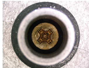
Figure 3: Brass terminal connection with dielectric grease at 20x magnification.

NGK utilizes an anti-corrosive brass terminal connection insulated with dielectric grease to reduce corrosion (Figures 3–4 below). In turn, this optimizes engine performance and can improve fuel economy up to 20%, which can yield an additional 4-6 mpg. NGK is the Ignition Specialist.