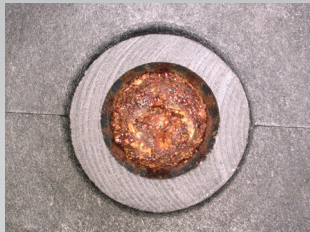
Figure 1: Corroded zinc-plated terminal connection at 20x magnification.

Ignition coils that are used in many Chrysler, Dodge, Ram and Jeep models feature steel secondary winding terminal connections that are plated with zinc. When these connections become corroded (Figures 1–2 below), engine performance is reduced and fuel economy is lowered . Over 2.5 million Chrysler, Dodge, Ram and Jeep vehicles with zinc-plated coil terminal connections are in operation today.