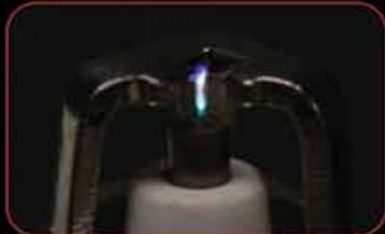
Multiple Ground Electrode Plug