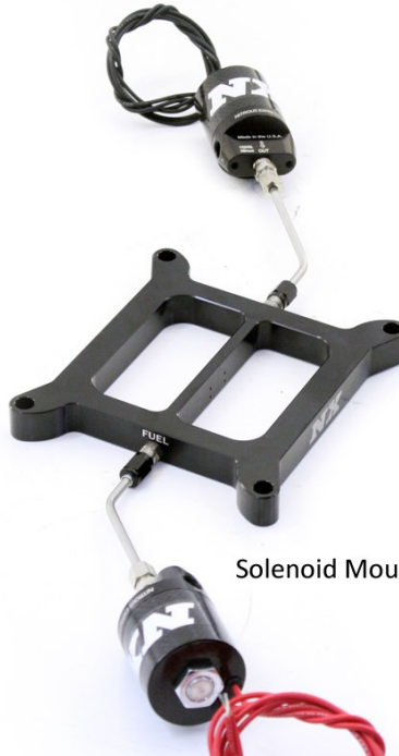
Solenoid Mounting Example