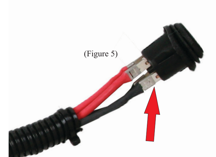
Put Red wires on one side and Black wires on the other side of plastic divider