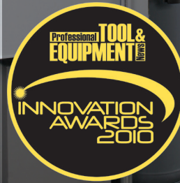
5280 DPF Cleaner