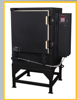
5281 Thermal Processing Unit