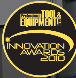
5280 DPF Cleaner