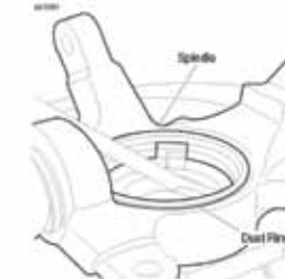
Figure 1. Ball Joint Removal