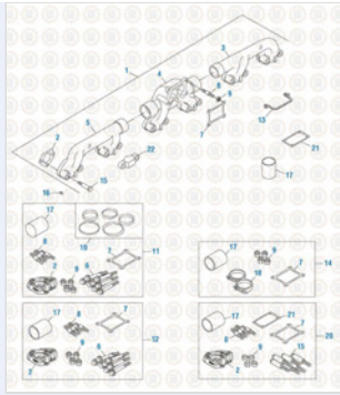
Cummins Engine 2017 Pulse Exhaust Manifolds - Current Style - 855 Series