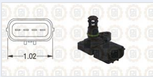
Sensor Catalog 2019 Dual Function / EGR Sensors - Sensor Catalog