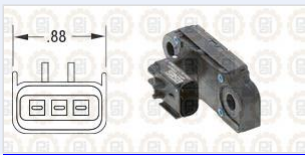
Sensor Catalog 2019 Differential Pressure Sensors - Sensor Catalog