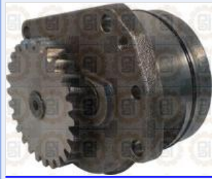
Water Pump, Thermostats and Oil Pump 2017 L10, ISM, M11 Series Oil Pumps - Oil Pumps