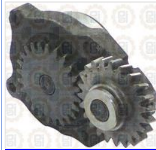
Water Pump, Thermostats and Oil Pump 2017 B Series Oil Pumps - Oil Pumps