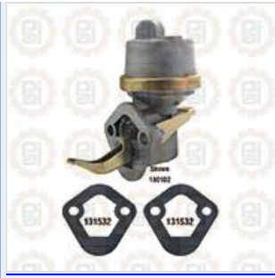
Cummins Engine 2017 Fuel Transfer Pumps - 6B Series