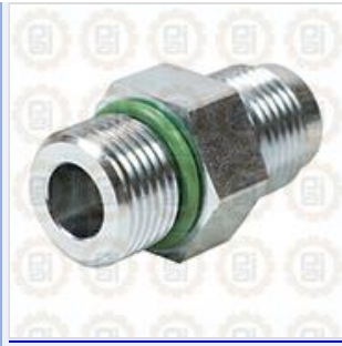
Cummins Engine 2017 Fuel Miscellaneous - N14 Series