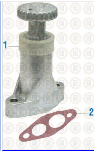
Caterpillar Engine 2019 Primer Pump - 3300 Series