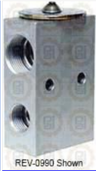
Cab Catalog Valves