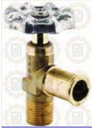
Air & Electrical 2019 Heater Components